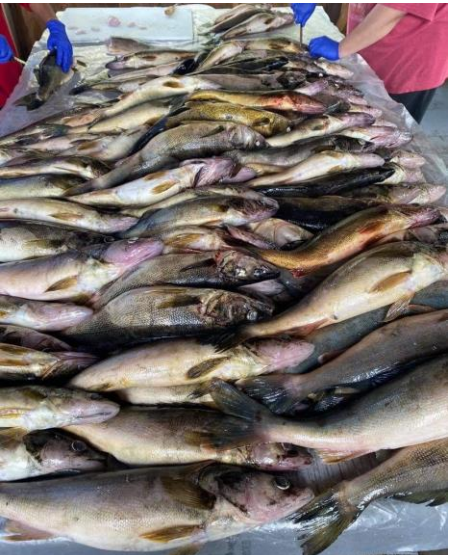
Fish getting ready to be filleted and packaged up! Lake St. Joseph Commercial Fishing primarily catches walleye. They can catch anywhere from 500 lbs. or more on a good weekend, which they will then sell in 5 lb. bags.