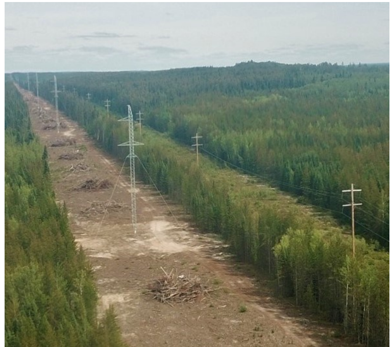
Wood piles along the ROW