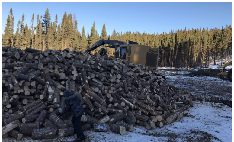
Harvested timber along the transmission line corridor being collected

Unsure of the schedule? Ask your Community Liaison, check the latest newsletter, or contact watayinquiries@wataypower.ca